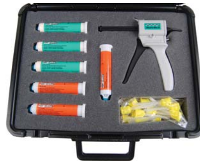
Kit No. 16309, Repro-rubber Combo Thin Pour & Orange