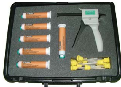
Kit No. 16305, Repro-rubber Orange