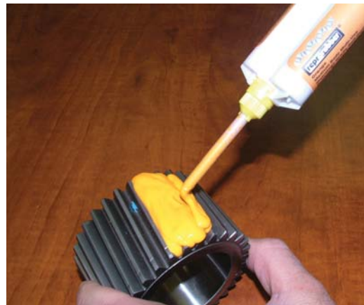
Shown Above: Quick Dispense internal casting (left) and external casting (right) using the new Flexbar Repru-Mix II Dispensing Gun System.