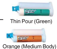
Orange (Medium Body)

Prefilled 50ml Dual Barrel Cartridges 1:1 Ratio