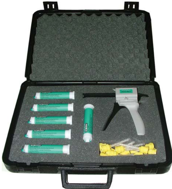
Kit No. 16300, Repro-rubber Thin Pour (Green)

Repro-rubber Quick Dispense Cartridge System Kits contain everything you need to easily create Highly Accurate, Zero Shrinkage replicas. Each kit includes 1 each Repro-Mix II Reusable Dispensing Gun, 6 each 50ml Prefilled Repro-rubber Disposable Cartridges, 15 Disposable Mixing Nozzles, 2 Micro Injector Snap-On Nozzles, and a Deluxe Fitted Carrying Case.