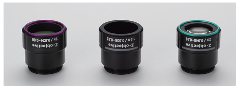
Z-objective 1X (optional)

The newly designed 7X-zoom unit and optional interchangeable objectives provide magnification from 13X-184X on the monitor. A wide range of measurement is covered: wide view measurement at low magnification, to micro-measurement at high magnification.