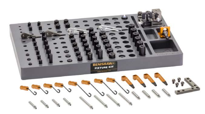
Comprehensive set of components