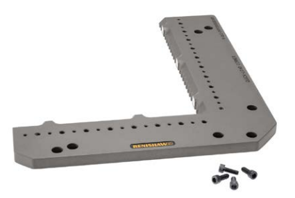
Quick load corner (QLC)*