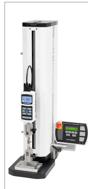
Shown with an ESM303 test stand and G1008 film & paper grips

On-board data memory for up to 50 readings is included, as are statistical calculations with output to a PC. Integrated set points with indicators and outputs are ideal for pass-fail testing and for triggering external devices such as an alarm, relay, or test stand. The gauges are overload protected to 200% of capacity, and an analog load bar is shown on the display for graphical representation of applied force.